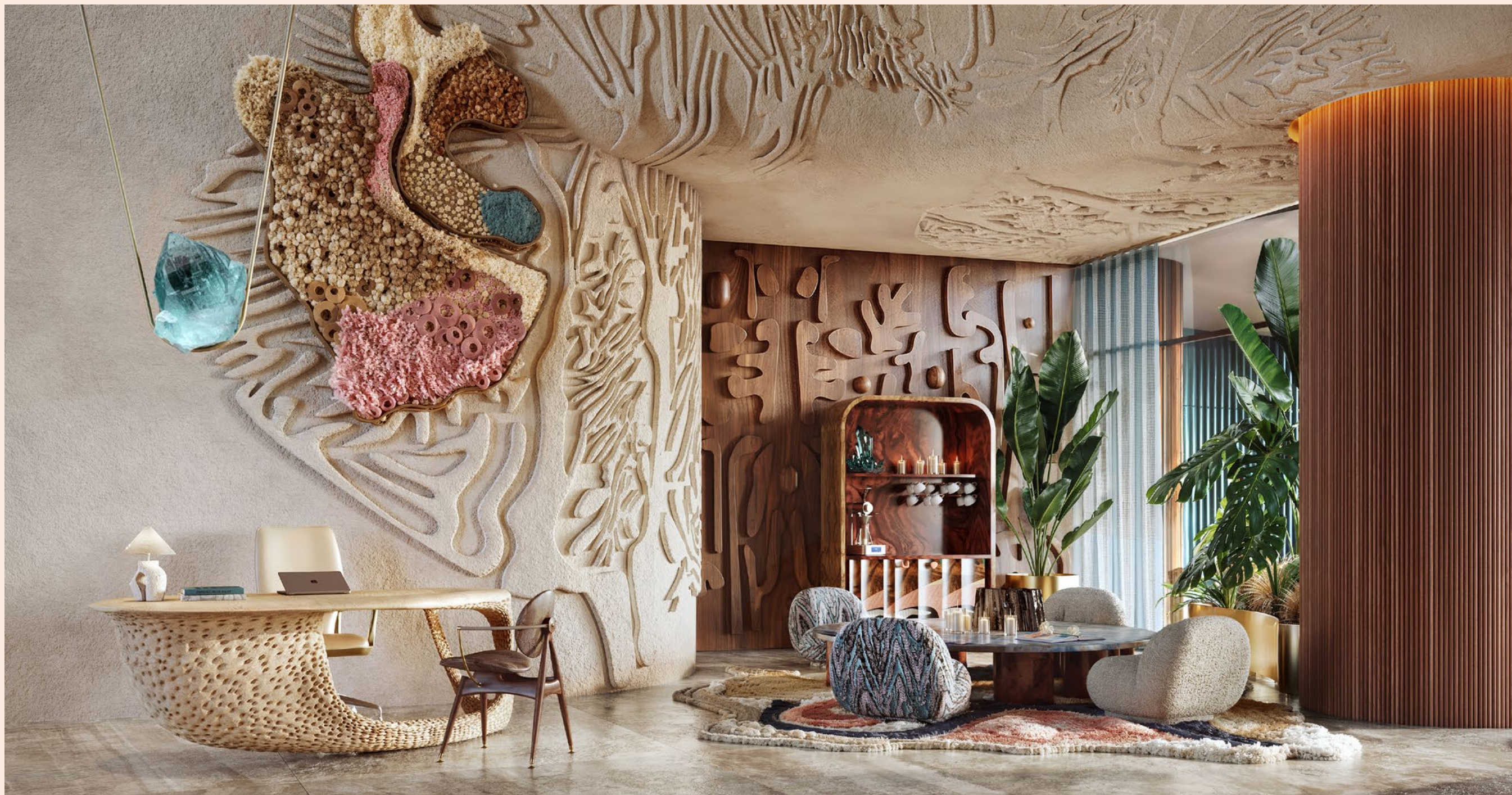
THE LOBBY/ RECEPTION