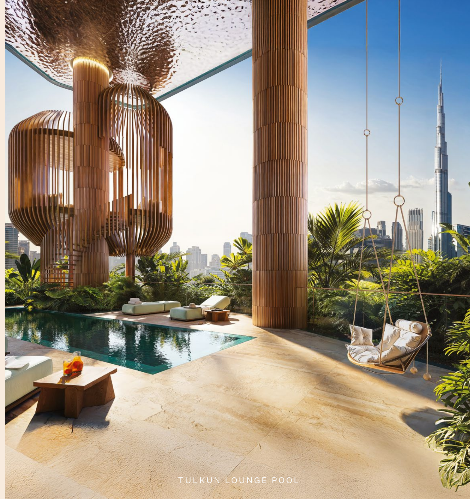
TULKUN LOUNGE POOL

Crafted for the residents of the apartments above, it offers a curated selection of exceptional amenities dedicated to comfort, wellness, and relaxation—an elevated sanctuary above the hustle and bustle, where every moment is a celebration of tranquility.