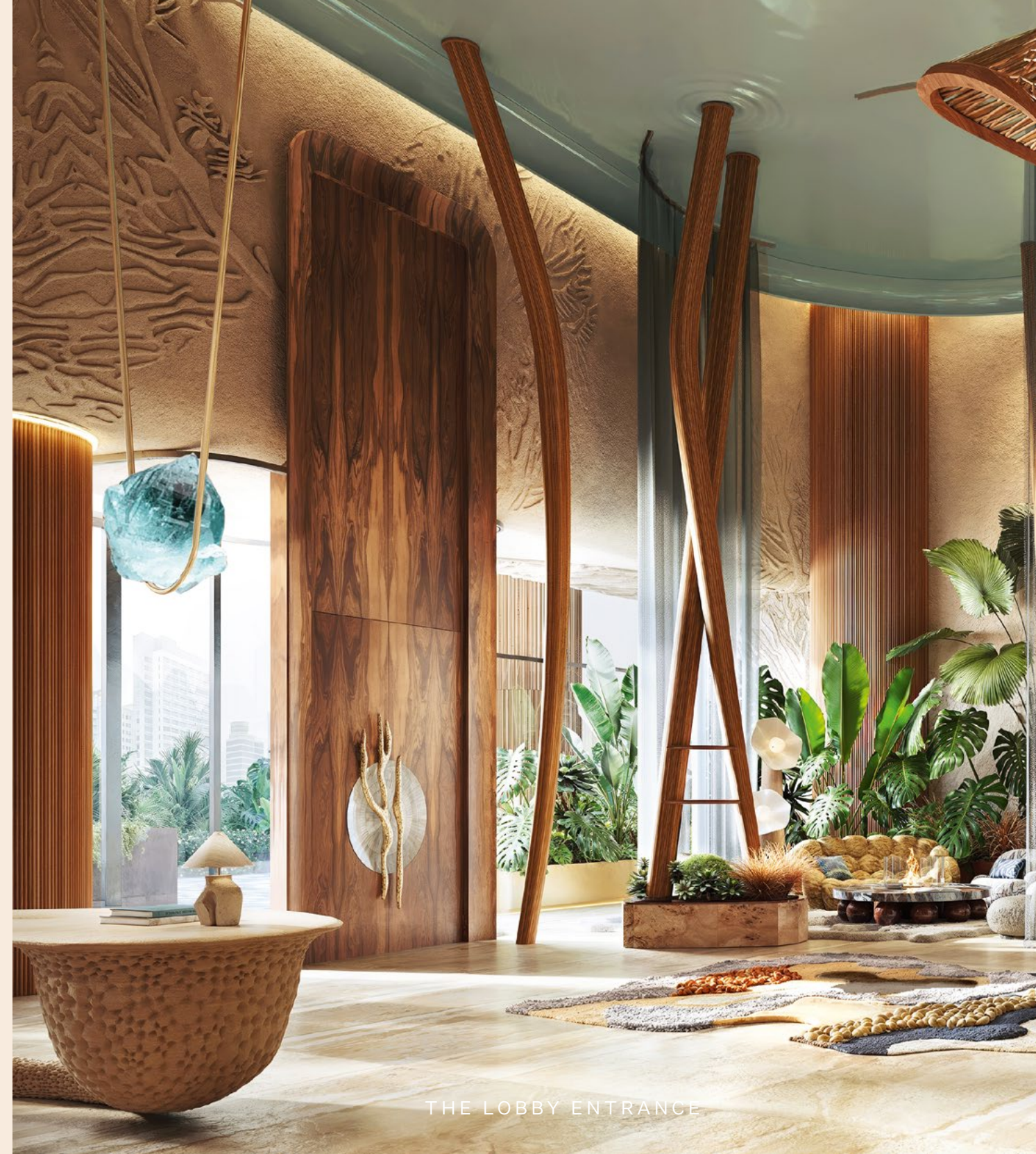
THE LOBBY ENTRANCE

The first breath, the first sound, the first step into Eywa instantly transports you from a frantic, rushing world into the calm and serenity of a coral reef. Every sense is engaged — gently anchoring you in stillness, presence, and ease.