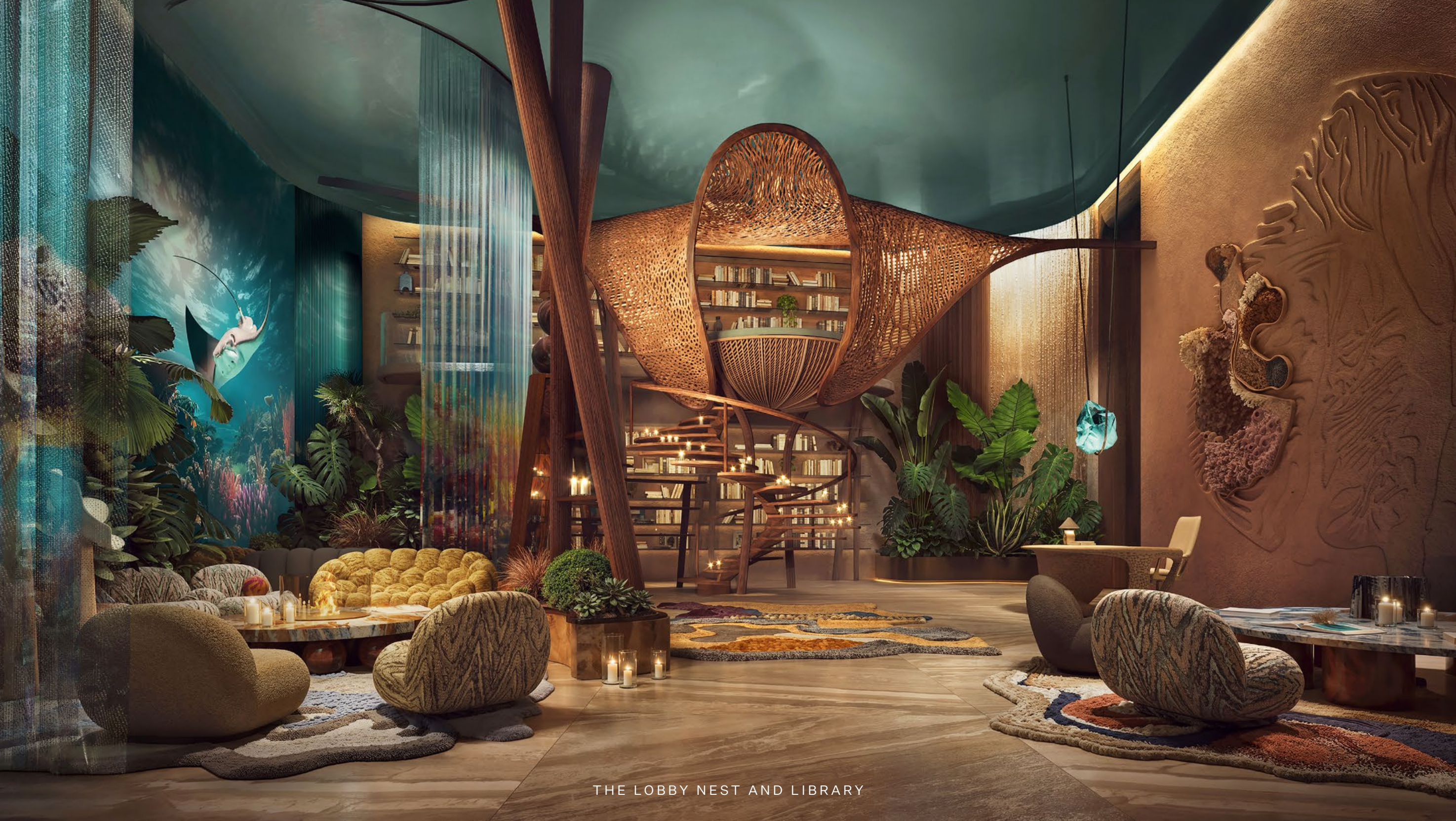
THE LOBBY NEST AND LIBRARY