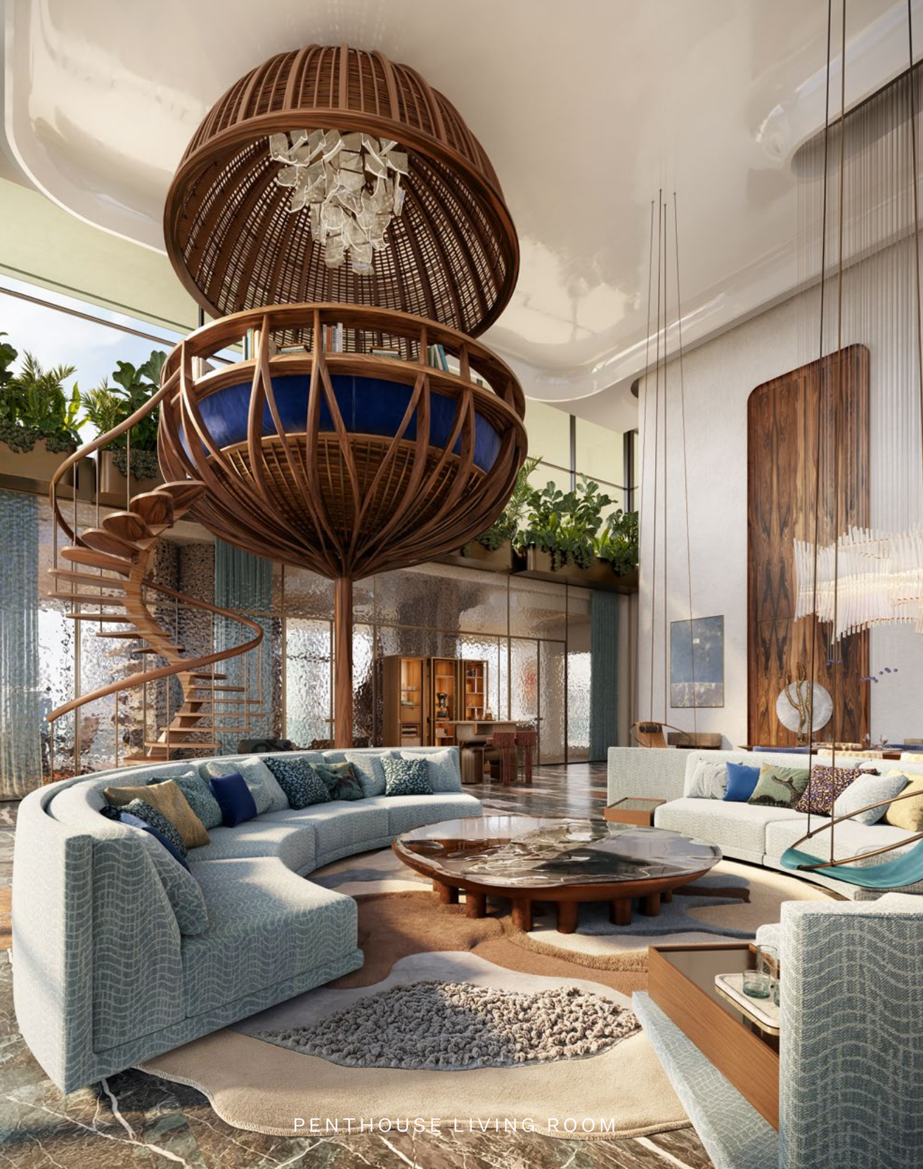
PENTHOUSE LIVING ROOM