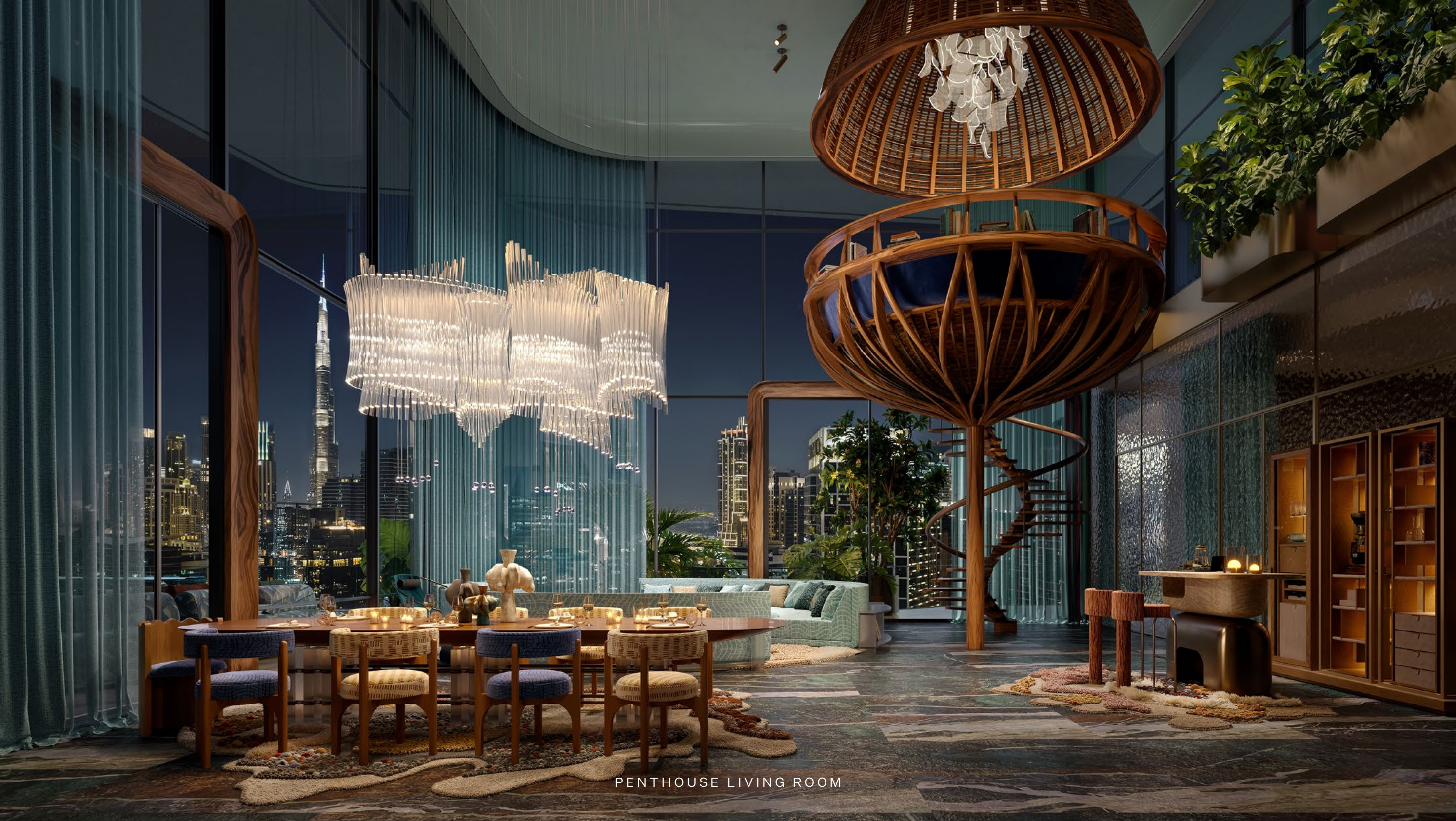
PENTHOUSE LIVING ROOM